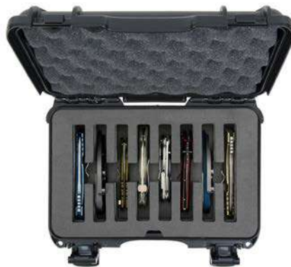
909 8-Knife Case