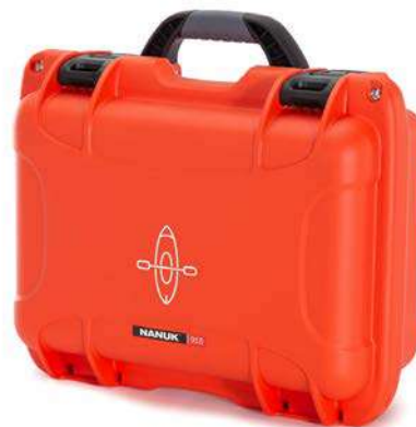
915 Kayak Case

Exterior dimensions L12.64" x W9.0" x H4.38" L321mm x W229mm x H111mm